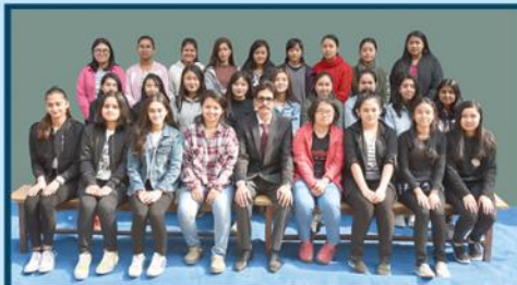
ICSE 2018 BATCH (GIRLS)

Our understanding of the students' needs at different stages of their preparation, has been the guiding force behind the structure and methodology of each subject.