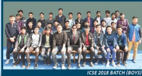
ICSE 2018 BATCH (BOYS)

Our I.C.C. Programme is unique in itself as it ensures the best possible result depending on the basic potential of the student and his/her capability to work hard. Students admitted to our I.C.C. Programme can expect significant improvement in their performance in the final board examination.