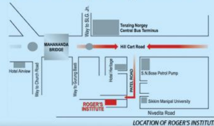
LOCATION OF ROGER'S INSTITUTE

To maintain our tradition of always providing the best to our students, we can assure you that with our dedication, perfect guidance and sincere efforts, we can no doubt help you to realise your cherished dream.