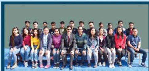
ICSE / CBSE 2018 Batch